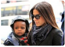
'Adoption Worked Better For My Career'