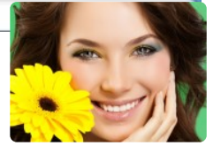
Blow Your Coworkers Away With A Recharged Spring Look