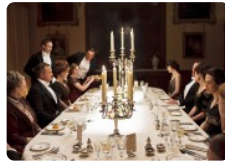
11 Things Not To Do When Dining With Clients