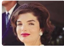
This Isn't Your Mother's Junior League: What Every Career Woman Should Know